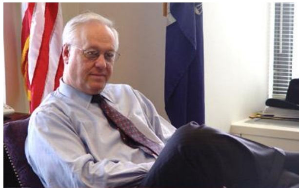
Figure 4 – Former NYS Comptroller Alan Hevesi 13

The Comptroller's Office hoped that by expanding the responsibilities of the Empire Zone Oversight and Designation Board, individual zones and businesses will be held responsible for their shortcomings. 14 However, the New York State Assembly failed to institute any of the Comptroller's proposed reforms. Shortly after the Comptroller's report, the Assembly voted to add the Empire Zones reforms to a growing list of unfinished business in Albany. Though the Assembly recognized significant problems with the program, it voted to extend Empire Zones, as is, until it could be re-examined at