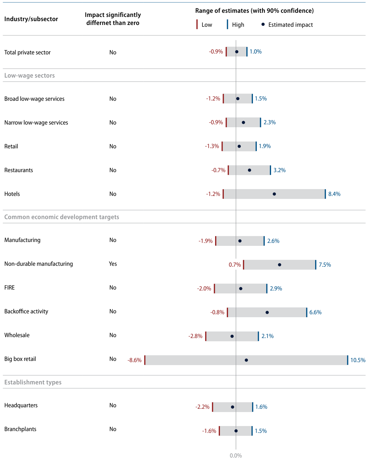
FIGURE 2 Living wage establishment impacts

Note: All specifications include controls for the natural log of population, city linear trends, and city and year fixed effects. N: 465, 16 controls and 15 treatment cities.