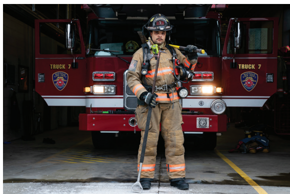
Firefighter, Buffalo Fire Department

“When union membership decreases, the wages decrease, and when wages decrease, the community as a whole hurts, so, as nonprofits and social services, we need to pick up that slack. As wages go down, the need for social services goes up. If individuals are being paid a living wage, they’re able to provide for themselves.”