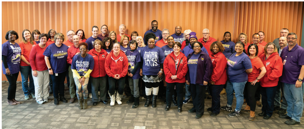
Healthcare workers meeting to prepare for collective bargaining.