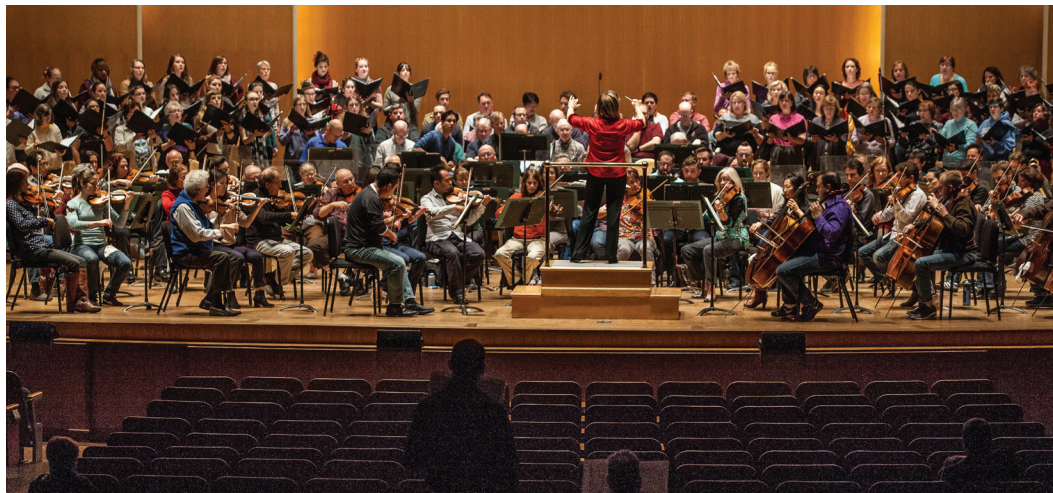
Musicians in Rehearsal, Buffalo Philharmonic Orchestra