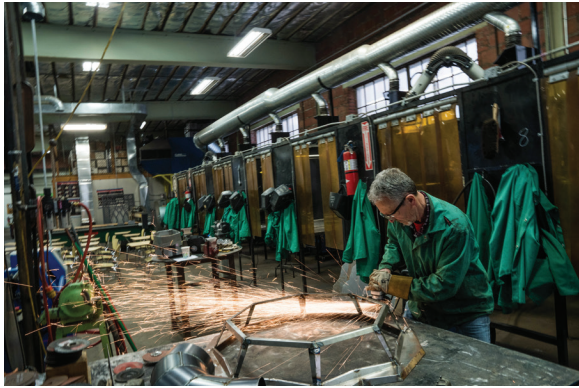
Retired Sheet Metal Worker Volunteering to Replicate an Historic Lighting Fixture for Buffalo's Central Terminal

“We don’t consider ourselves just a labor organization; we’re also a community outreach organization. We fund toy drives and food drives, not only to help our own members but to help the community.”