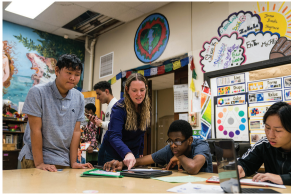
Teacher and Students, Art Class, Lafayette International High School