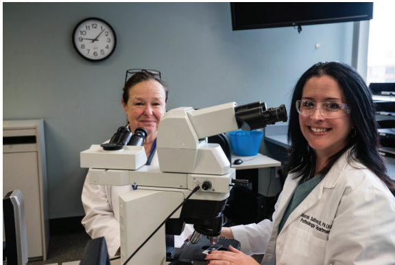
Researchers, Roswell Park Cancer Institute